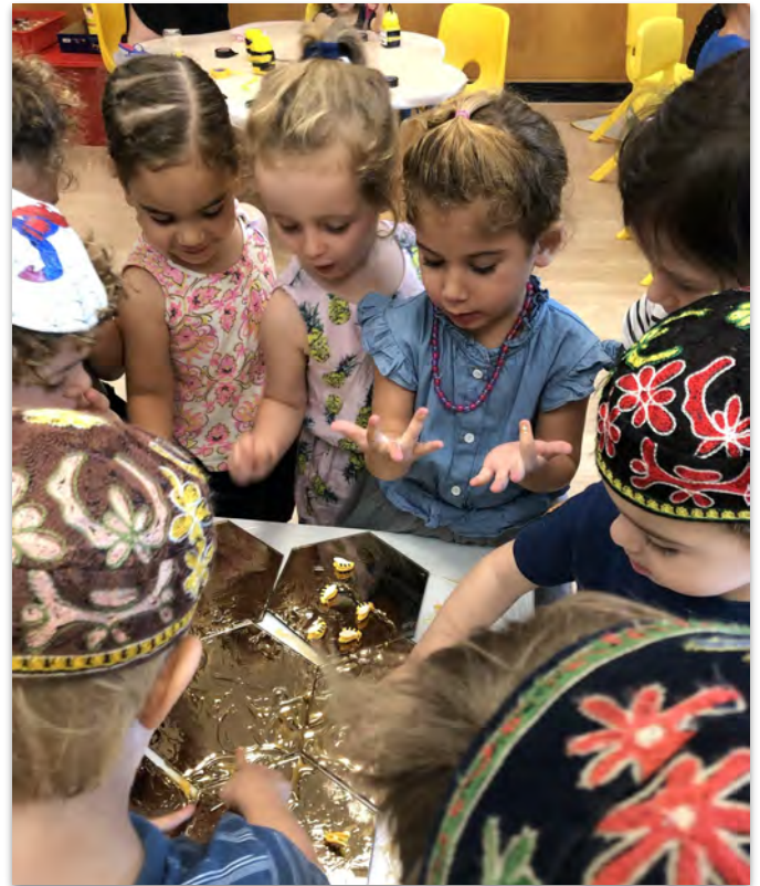
Children playing with honey..